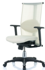
HÅG H09 Inspiration 9220