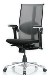
HÅG H09 Inspiration 9220 w/polished aluminium five star base (optional)