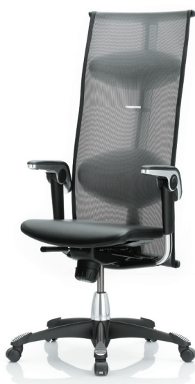
HÅG H09 Inspiration 9230